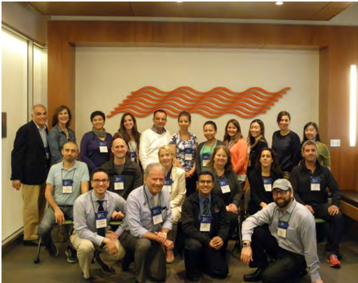
2017 CMS Participants and Faculty