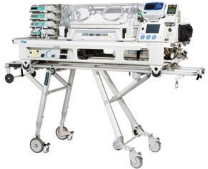
Drager Globe-Trotter GT5400