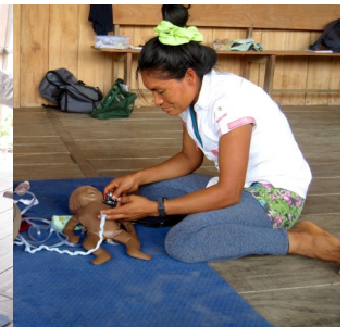
Simulations in the Ecuadorian Amazon.