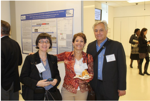
2014 Hot Topics.