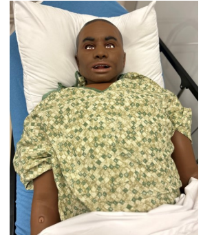
Taylor SimMan 3G PLUS Dark