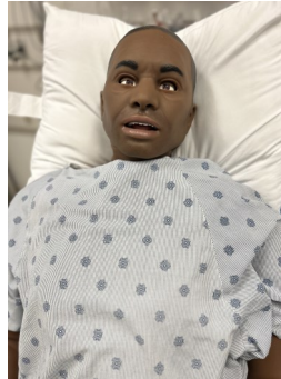
Avery SimMan 3G PLUS Dark