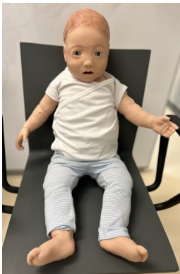
Madison SimBaby Light

NYSIM would like to introduce our new high-fidelity patient simulators to the NYSIM community! Our new manikins provide our NYU Grossman School of Medicine (NYUGSOM) and the City University of New York (CUNY) undergraduate, graduate and continuing medical education learners with superb medical training for simulated nursing, paramedic, medical assistant and hospital-based programs.