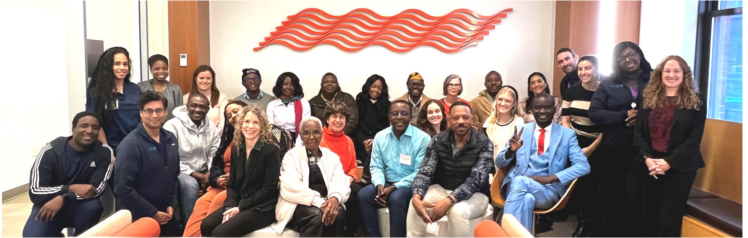
Pictured: NYCSE course participants and the NYSIM team